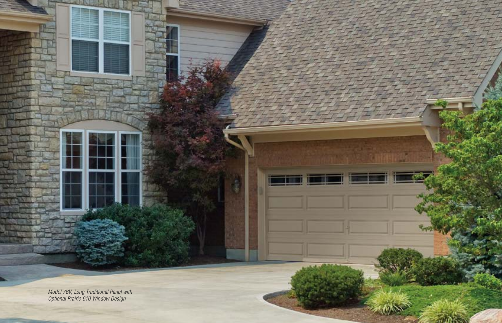
Model 76V, Long Traditional Panel with Optional Prairie 610 Window Design