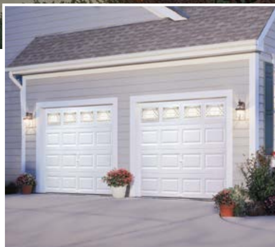
Model T41S, Short Traditional Panel with Optional Short Trilliant Window Design