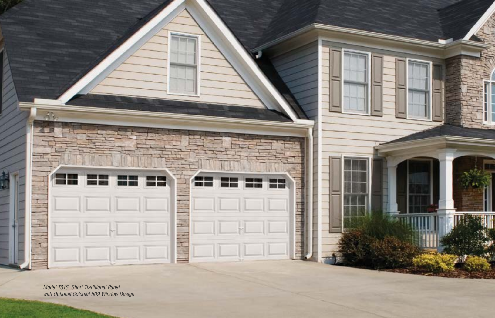
Model T51S, Short Traditional Panel with Optional Colonial 509 Window Design