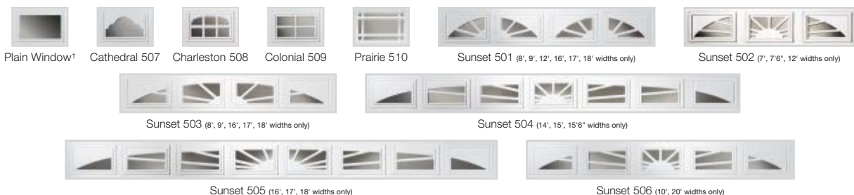
Plain Window† Cathedral 507 Charleston 508 Colonial 509 Prairie 510 Sunset 501 (8', 9', 12', 16', 17', 18' widths only) Sunset 502 (7', 7'6", 12' widths only) Sunset 503 (8', 9', 16', 17', 18' widths only) Sunset 504 (14', 15', 15'6" widths only) Sunset 505 (16', 17', 18' widths only) Sunset 506 (10', 20' widths only)