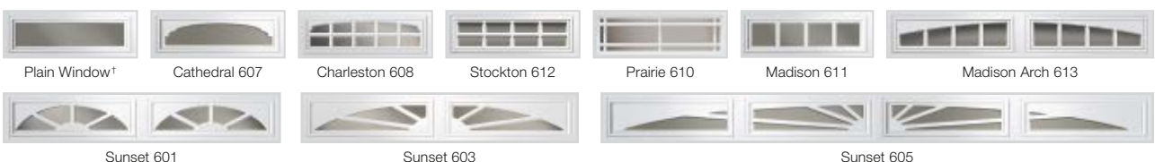
Plain Window† Cathedral 607 Charleston 608 Stockton 612 Prairie 610 Madison 611 Madison Arch 613 Sunset 601 Sunset 603 Sunset 605

* Panel emboss may not align on long window with short panels. Some size limitations apply.