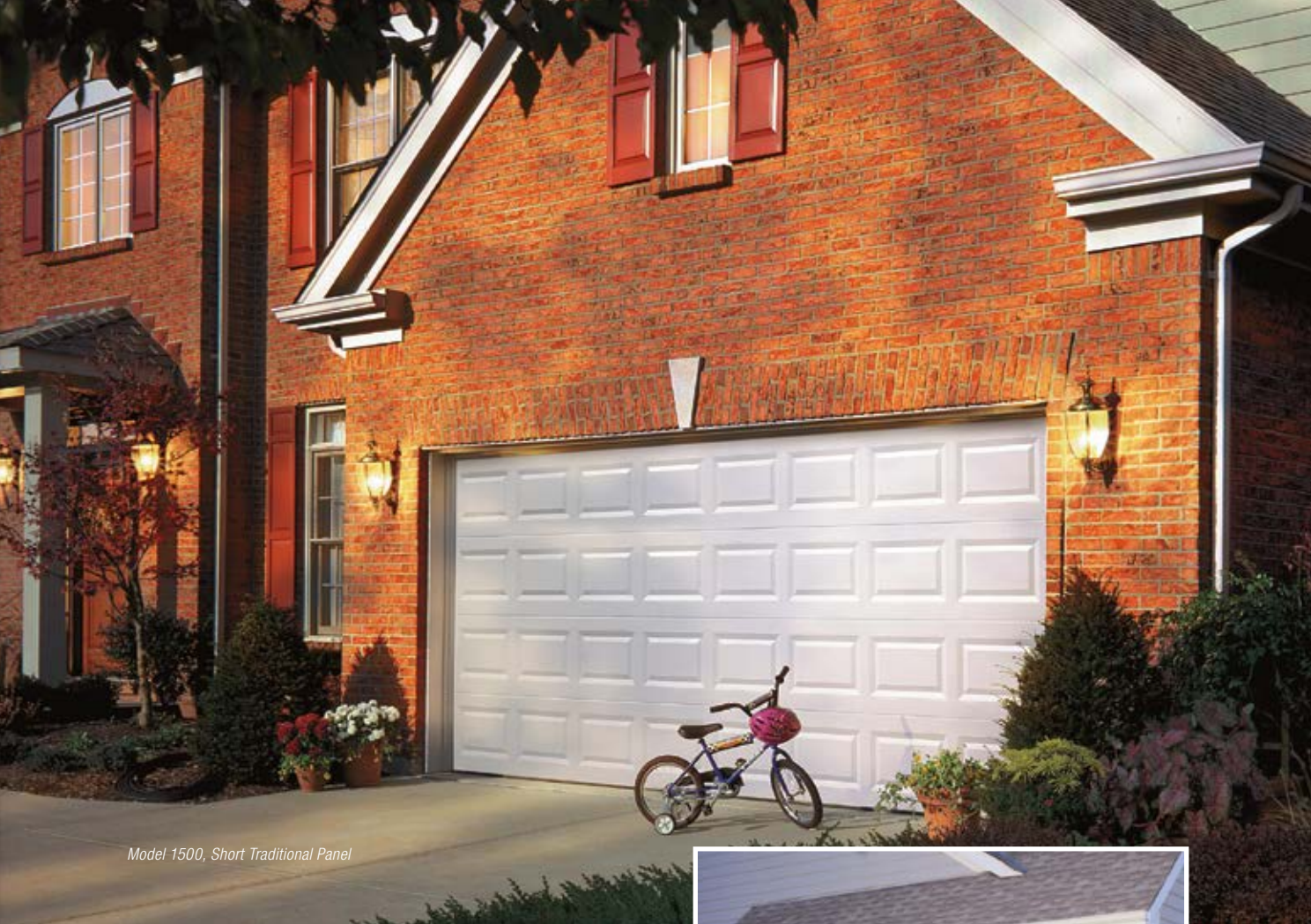
Model 1500, Short Traditional Panel