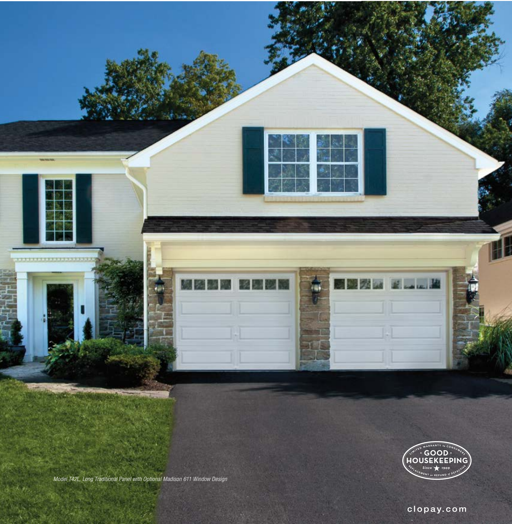
Model T42L, Long Traditional Panel with Optional Madison 611 Window Design