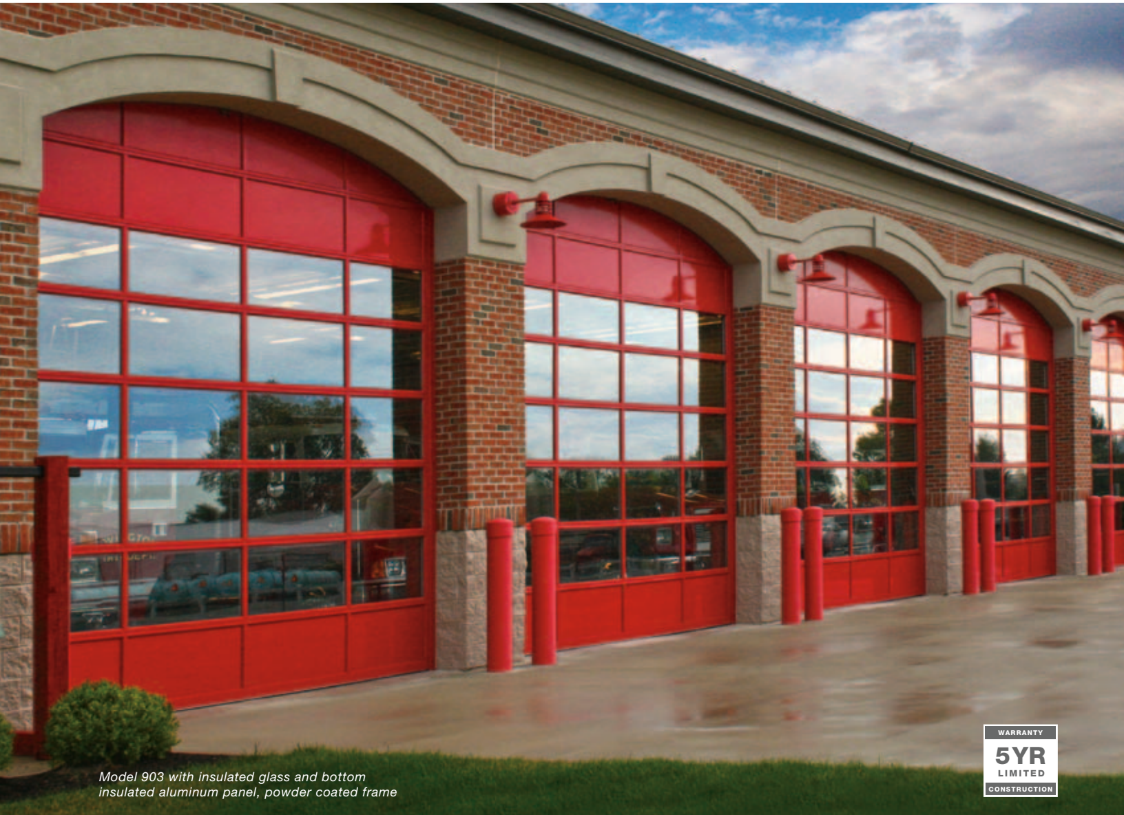
Model 903 with insulated glass and bottom insulated aluminum panel, powder coated frame