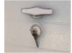
Outside keyed lock