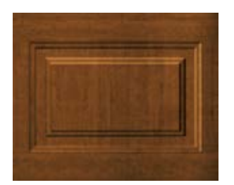
Classic Medium Finish