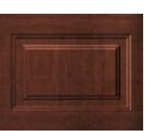
Classic Cherry Finish