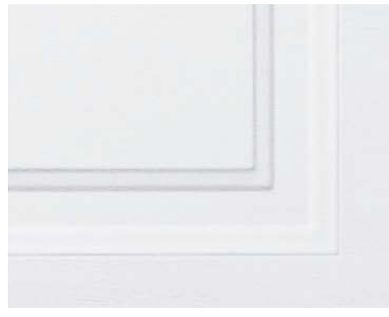
Deep panel edging and natural embossed woodgrain texture improve appearance close-up and from the curb.