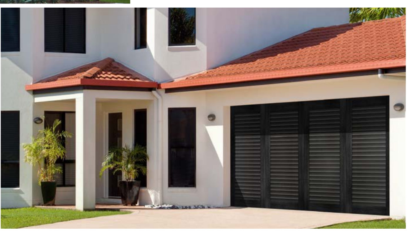
Canyon Ridge @ Collection Limited Edition Series Design 54; Shown in Black Finish with Louver Mahogany Cladding and Mahogany Overlays (Model CAN254LM)

Note: Cladding and overlay material options may be mixed and matched.