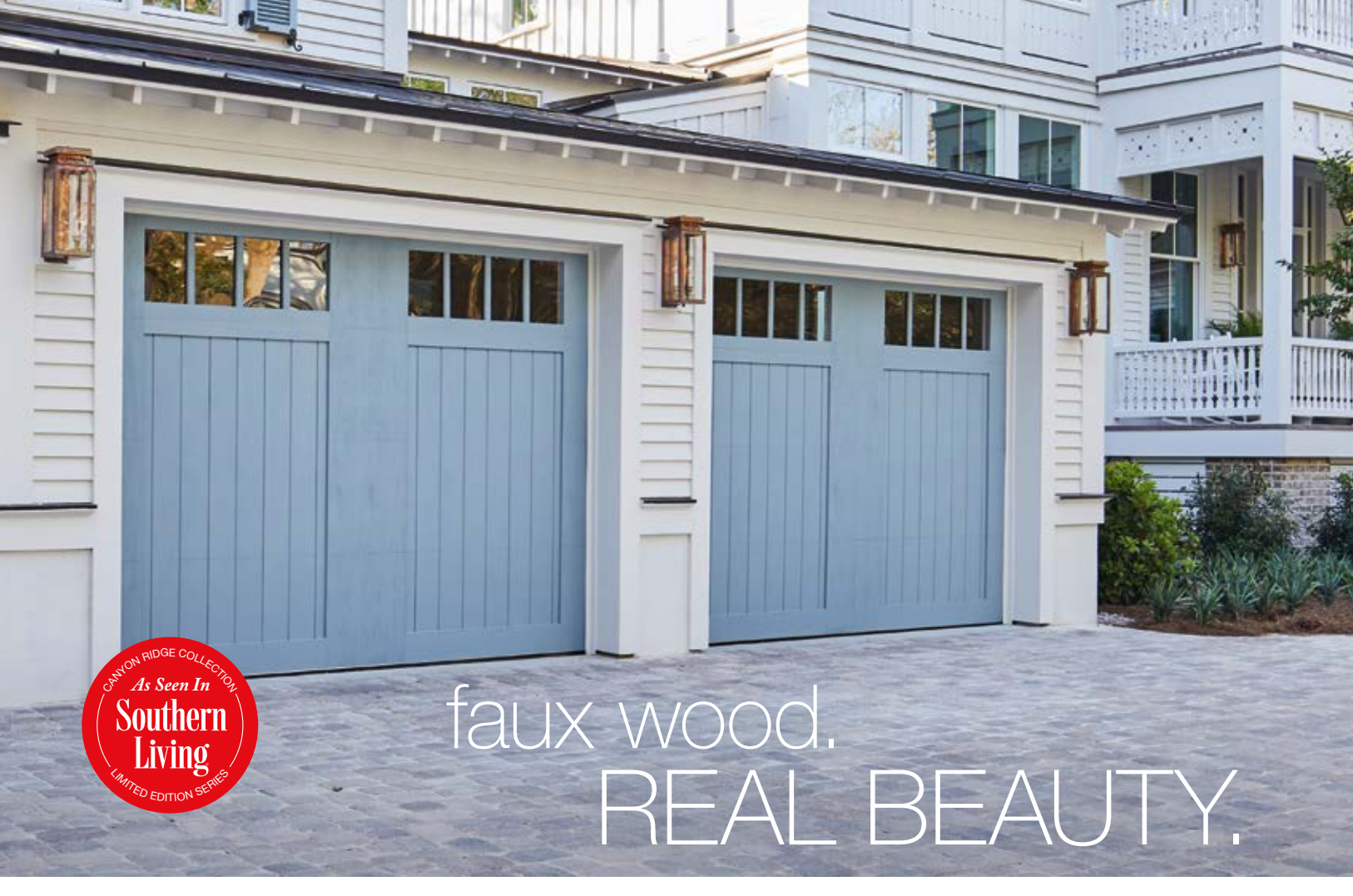
Canyon Ridge® Collection Limited Edition Series Design 11; Shown Custom Painted with Clear Cypress Cladding, Clear Cypress Overlays and REC14 Window Design (Model CAN211CCREC14)