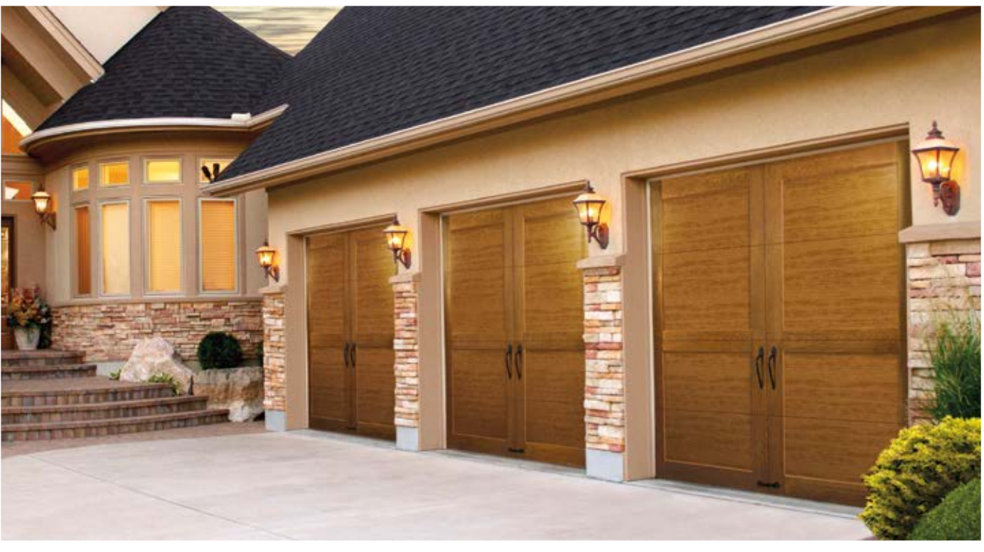
Canyon Ridge® Collection Ultra-Grain® Series Design 36; Shown in Medium Finish with Clear Cypress Overlays and TOP11 (Solid) Top Section (Model CAN236NCTOP11)