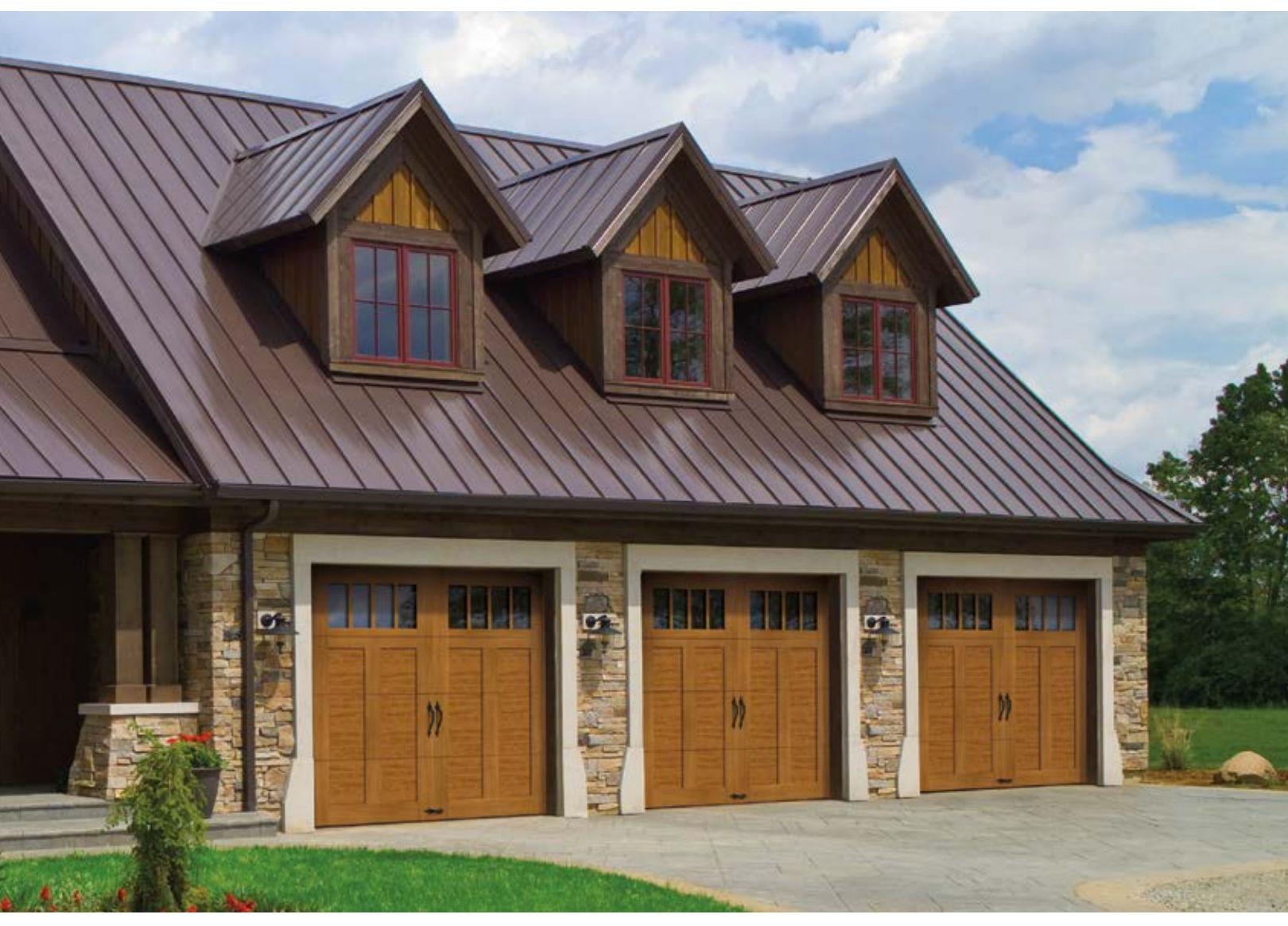
Canyon Ridge® Collection Ultra-Grain® Series Design 12; Shown in Medium Finish with Clear Cypress Overlays and REC14 Window Design (Model CAN212NCREC14)